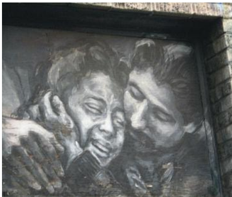
Above: Portion of mural at the corner of First Street and St. Louis Street, Boyle Heights