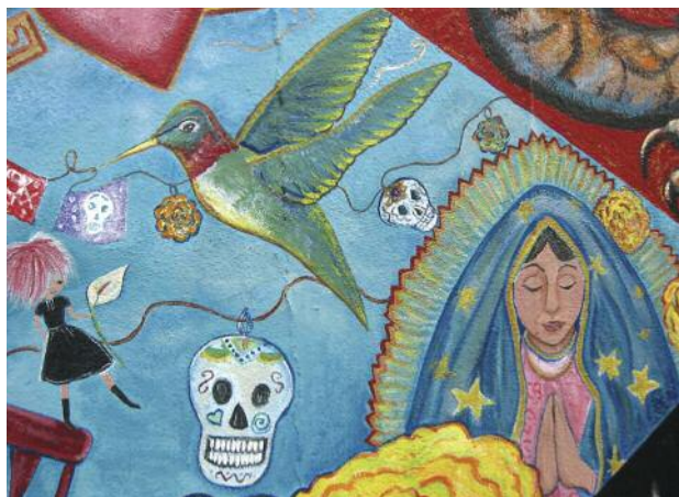
Below: Detail from mural, "Una Trenza" on wall of Self-Help Graphics, 1300 East First Street, Boyle Heights

We will revisit some of these questions in later sections of this report, and in our Conclusions we will address the issue of needed education, outreach, and support.