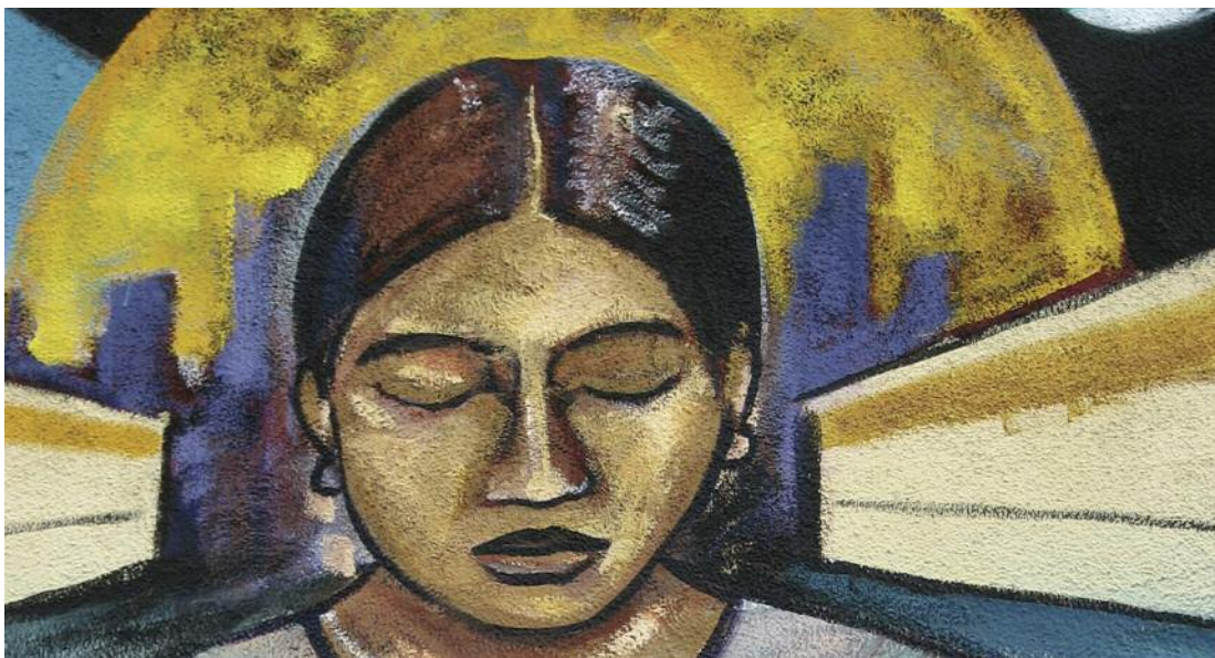
Below: Detail from "Una Trenza" mural, on wall of Self-Help Graphics, 1300 East First Street, Boyle Heights

for an oral examination during pregnancy and the need to take their children to the dentist by age one; our focus groups