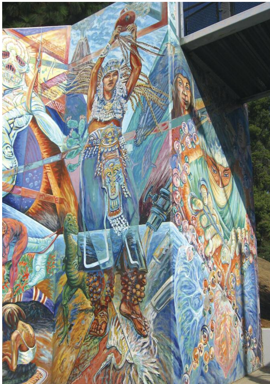
Left: Portion of “Stairway to Global Health” mural by East Los Streetscapers, across the street from Bravo Medical Magnet High School, 1200 Cornwell Street, Boyle Heights